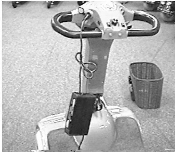
Battery Charger Hook up