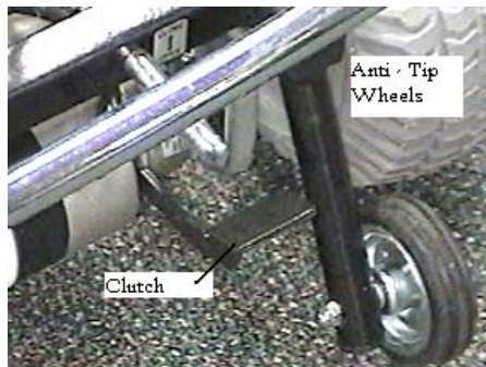
Clutch Release for the scooter