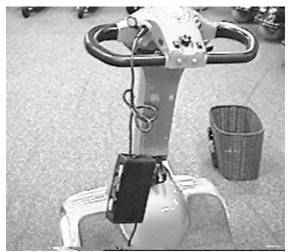
Battery Charger Hook up